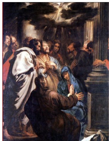
Pentecost - Anthony Van Dyck (1599-1641), Schloss Sanssouci, Postdam

The Holy Spirit's actions within us give us power to do great things. When faced with the seemingly impossible, we can call upon the Holy Spirit for